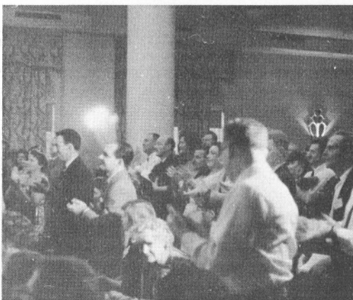
Some of the Congress attendees giving a round of applause at the last lecture.