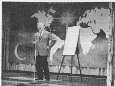
L. Ron Hubbard Speaker